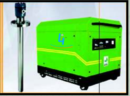
Anti Fuel Pilgrage